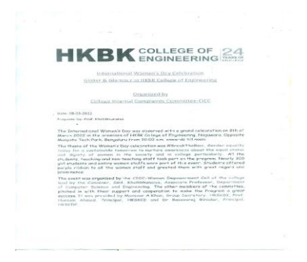
International Womens Report 1

3- International Women's Day was organized on 8<sup>th</sup> March 2022 by CICC team.